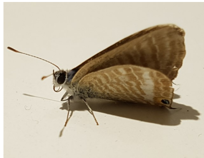
Long-tailed Blue

The butterfly is a rare migrant that cannot withstand the UK winter. Butterflies migrating to the UK in August lay eggs which hatch out from mid-September, so peak numbers are late in the season, a similar pattern to Clouded Yellows. Herts & Middx records for this species are all in Middx. Singles were seen at Greenford (1945), Finchley (1950) and Heathrow (1980). The only year with multiple records is 1990, when two small colonies, were established in Kensington (Kensal Green Cemetery) and Islington (Gillespie Park near Arsenal Station), with maximum counts of 10-12 individuals at each location. The next record was from Tower Hamlets (East India Dock), a single male on 10th August 2012. Terry’s record is the only other outdoor record in our branch area.