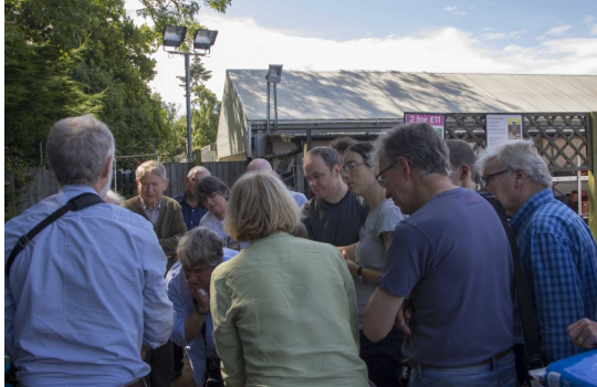
New members gathered around the moth trap

We visited the adjacent Ellenbrook Fields for our post-lunch butterfly walk.