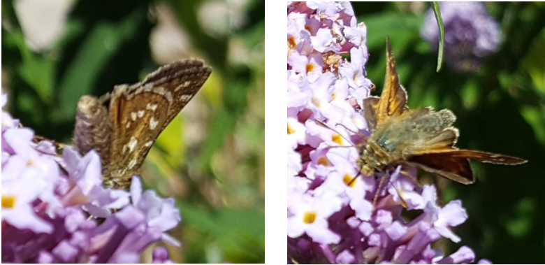
Silver-spotted Skipper on Buddleia.

northerly confirmed sighting in Britain of recent years. So where has it come from? I think it is unlikely to have been introduced by deliberate human intervention. SSS are not sufficiently spectacular to tempt people to make an unauthorised transplant of adults, in my opinion, and they are apparently a difficult species to rear from eggs. So it seems more likely that it is a long-range vagrant from one of the stronger northern colonies.