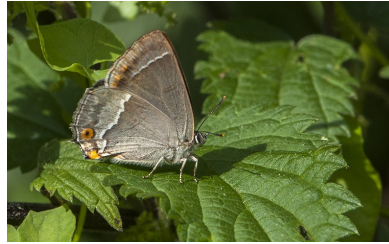
Purple Hairstreak, photos © Peter Clarke

sitting on a grass stem or flower head affording good photo opportunities. Returning towards Norton Green Common in the open area I had noticed that my generous offerings of shrimp paste and tuna were apparently ignored by any Purple Emperors. As we entered the meadow at just after noon the sun reappeared. Someone spotted a Silver-washed Fritillary glide over the western side so perhaps things were starting to look up. At 12:15 pm, Helen Lumley saw something dark and big flying towards a tall silver birch tree on the south-western edge of Watery Grove about 20 metres in from the track. And there he was, a beautiful male Purple Emperor, about 15 feet up the birch and stayed there for at least 45 minutes opening and closing its wings. Magnificent views were obtained of this very fresh specimen, possibly emerging from a nearby willow earlier today.