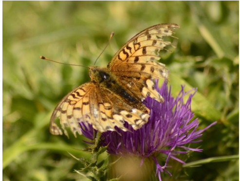
Dark-green Fritillary.

I would like to contribute a story of an encounter with a Dark-green Fritillary just outside of the Aldbury Nowers reserve a couple of seasons ago. On first observations I thought this character was a Comma due to its ragged appearance. Once settled refuelling on a flower I realised this was an encounter with a fritillary. For every passing insect this pugnacious butterfly would chase vigorously before eventually returning to the flower. Sometimes it flew up by the hedgerow coming perilously close to danger. For along that hedgerow odonata were patrolling, both brown and migrant hawkers. Somehow this butterfly managed to avoid becoming lunch and return to the flower. Despite the damage to the wings this veterans flight was unaffected and a real treat to sit and watch. Some photographers may chose to ignore these far from perfect specimens but I personally think they often have a better story to tell.